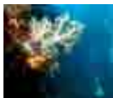
WRECKS & WILD REEFS