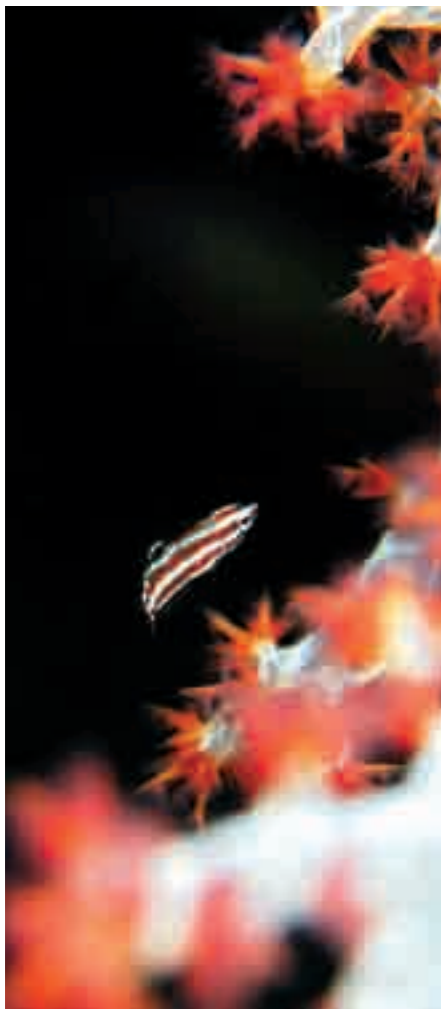
Clockwise from left: A juvenile wrasse hides in soft branching coral; Nusa Island Retreat, a five-minute boat ride from Kavieng; A spinecheek anemonefish looks out from the protection of its host anemone.

us fuelled. During the months from October to March the multitude of small islands and channels are dotted with apparently excellent surf breaks and the accommodation is often taken up by surfers, the owner Shaun being a keen wave rider himself. NIR lays on a great buffet every evening with a range of soups and fresh main courses, salads, veg and starches.